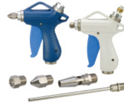
Blow Guns & Nozzles